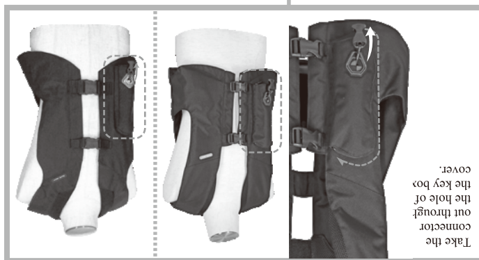
Photo 12 Take the connector out through the hole of the key box cover.

12. Take the connector out through the hole of the zipper around the key box. (Photo 12)