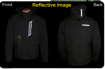
Reflective material for improved nighttime visibility.