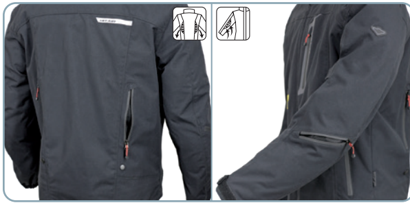
Ventilation zippers on sleeves and back.